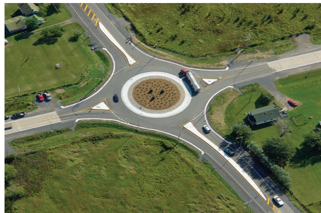
An update to the Transportation Master Plan is scheduled for completion in 2025. The main objective is to provide a clear direction for transportation planning over the next 10 to 20 years. The County will continue to work with local municipalities to ensure we maximize the use of the existing roadway systems including multi-use pathways and recreational trails, and to accommodate future projected travel demands. The plan will be reviewed every 10 years.