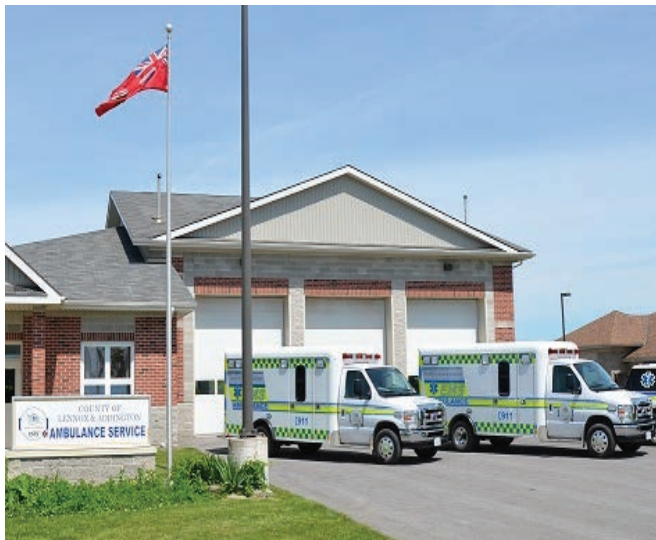
Lennox and Addington Emergency Services has acquired land in Loyalist Township for a new ambulance base and design work is underway.

The County continues to fund local healthcare including $75,000 per year for a ten-year period (from 2019 to 2028) for the $145M University Hospitals Kingston Foundation KGH Site Redevelopment Project and $50,000 per year for a ten-year period (from 2024 to 2033) for the $3.5M Lennox & Addington County General Hospital Foundation MRI acquisition.