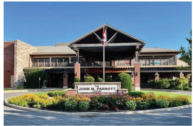
Staffing enhancements at The John M. Parrott Centre that will further augment our infection control capacity as well as helping to achieve our 4 hours of care and customer service excellence.