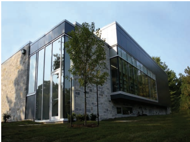
$719,700 for capital improvements to County-owned buildings and $1,237,500 for capital repairs, equipment and furnishings for The John M. Parrott Centre .

On March 19, 2025, Lennox & Addington County Council approved the 2025 budget, totalling $113.3 million in order to provide a broad range of services. Some highlights include: