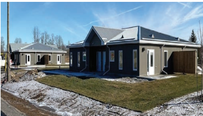
$1,082,900 for capital improvements to Social Housing .