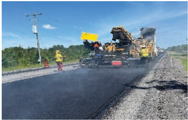
$19.3 million for capital improvements to County Roads & Bridges including the rehabilitation work on the Odessa bridge north of the 401 on CR 6 as well as the CNR overpass bridge on CR 22 in Loyalist. Urban rehabilitation of CR 11 and CR 17 through the Village of Newburgh has been budgeted for in 2025. Along with new granular and asphalt, works will include new sidewalk, curbs, and storm sewers. In addition, 9.5 kms of hot mix paving and 22.2 kms of surface treated roads. The County will receive $1.48 million in federal gas tax funds and $1.08 million from the Province to assist with the cost of road projects.