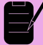
A lobbyist registry and registrar