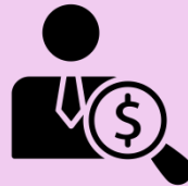
An Auditor General