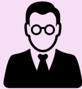
A municipal Ombudsman