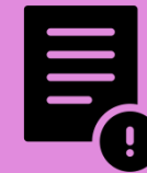
A closed meeting investigator